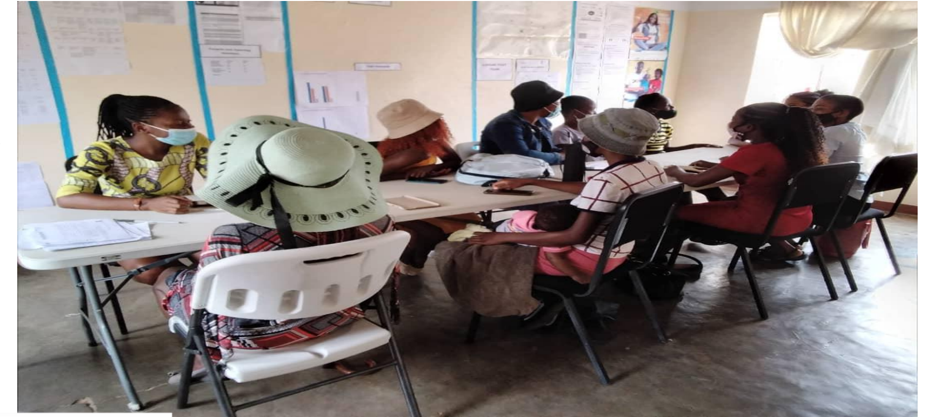
Image 2: PrEP adherence support group meeting for AGYW continuing on PrEP at a safe hub in Lupane District, Matabeleland North Province

Figure 2: Strategies to increase PrEP uptake and continuation among AGYW