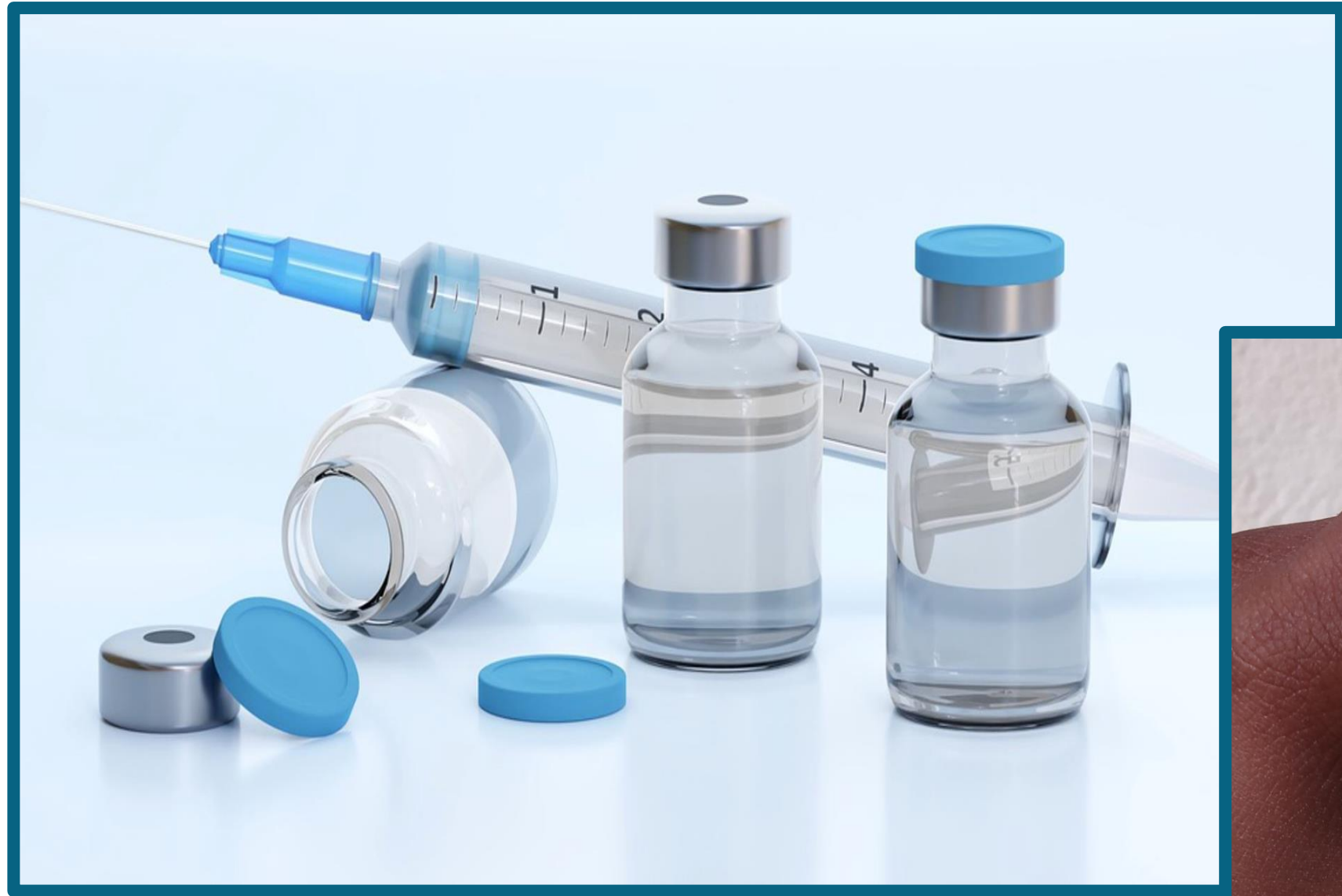
Injectable cabotegravir for pre-exposure prophylaxis - CAB PrEP

“The injectable is good. Also has some privacy because no one will know that you are using that. There is no forgetting as well unless maybe you miss the due date of getting another injection. The injectable is 99% effective, it’s okay [acceptable].” - Female public-sector PrEP provider